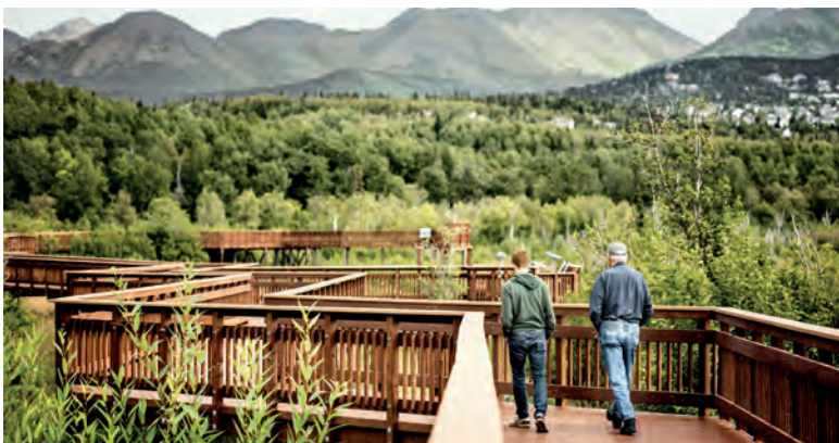
OPPOSITE PAGE: Rafting excursion. THIS PAGE: Potter Marsh wildlife viewing boardwalk in Anchorage.

OR enjoy this cruisetour in reverse with your land tour after your cruise: