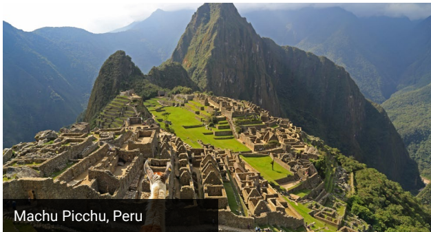
Machu Picchu, Peru