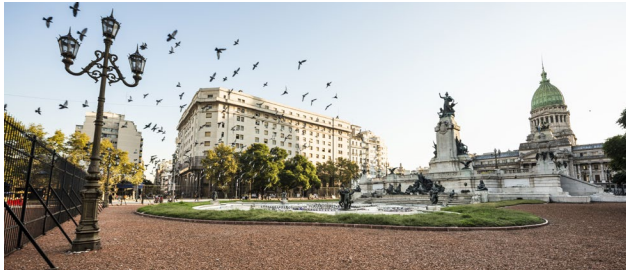
Buenos Aires, Argentina