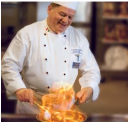
Princess cuisine is lovingly prepared from scratch each day, wherever on the ship you dine. princess.com/cuisine