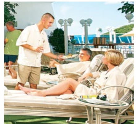
The Sanctuary is our signature haven for adults featuring massages, lounge chairs, spa fare and more. princess.com/retreat