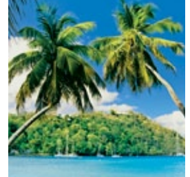
Caribbean, Mexico & Pacific Coast