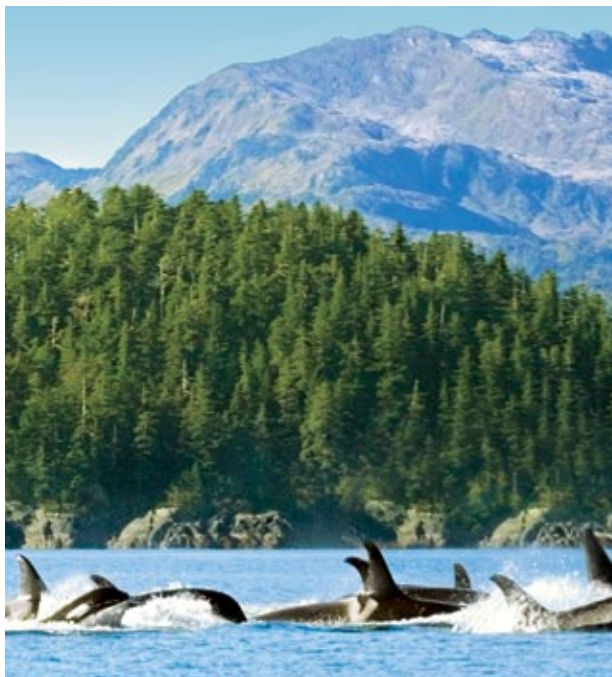
Orca pod swimming in Prince William Sound, Alaska

*Princess reserves the right to impose a fuel supplement of up to $9 per person per day on all passengers if the NYMEX oil price exceeds $70 per barrel, even if the fare has already been paid in full. Government fees and taxes of up to $95 per person are additional and subject to change. Northbound fares are based on 5/14/12 sailing. Southbound fares are based on 9/19/12 sailing. Certain restrictions apply. See page 7 for details.