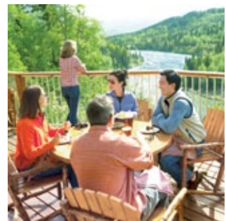
Kenai Princess Wilderness Lodge®