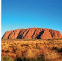
Australia & New Zealand