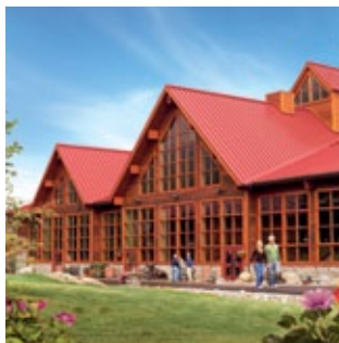
Denali Princess Wilderness Lodge®

Note: Motorcoach may be substituted for rail on some departures.