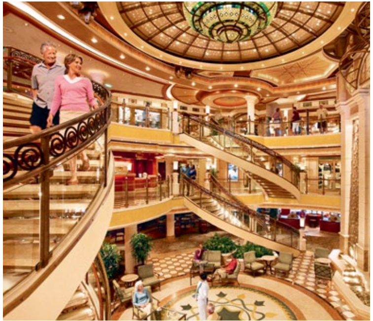
The Piazza , the central gathering spot on each ship, welcomes guests day and night with live music & entertainment, plus relaxing spots for coffee, a drink, even complimentary casual fare from the International Cafe, available all day long.

When you sail with Princess, you'll discover a relaxed, rejuvenating retreat at sea that transports you far from your everyday routine. Enjoy warm, welcoming service, tantalizing cuisine prepared from scratch, incredible entertainment and an array of engaging activities day and night. There's no better way to explore new destinations than with Princess Cruises — the Consummate Host.®