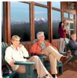
Mt. McKinley Princess Wilderness Lodge®