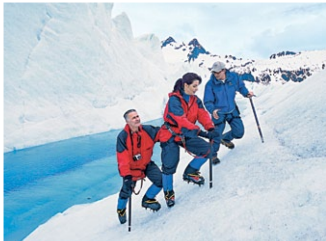
Glacier hiking in Alaska

Find more information about our excursions at: princess.com/excursions