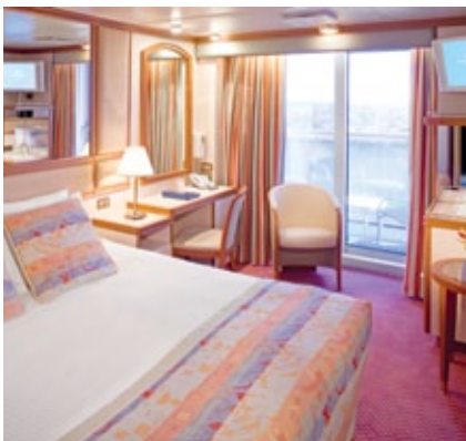
Well-appointed staterooms , spacious suites and affordable balconies come with pleasing amenities. princess.com/staterooms