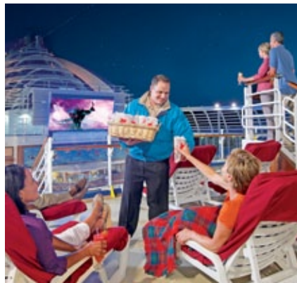
Movies Under the Stars ® a Princess original, features films, concerts and more poolside on a giant screen. princess.com/retreat