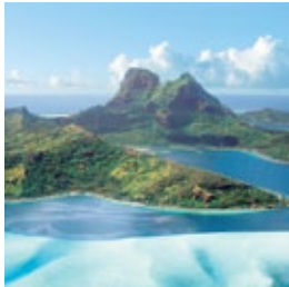
Hawaii, Tahiti & South Pacific