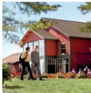
Copper River Princess Wilderness Lodge®