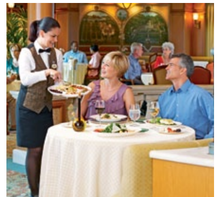
Sabatini's ™, our Italian restaurant, and the refined Crown Grill are among the specialty restaurants on board. princess.com/dining