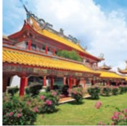
Asia, India & Africa