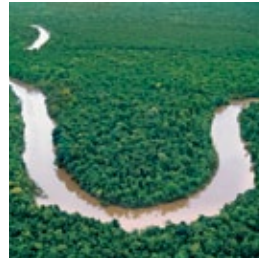
South America & the Amazon