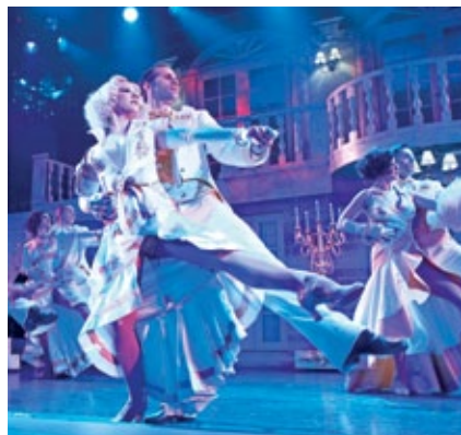
Original musicals are a hallmark of every cruise, with lavish productions and talented performers. princess.com/activities