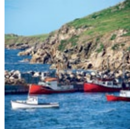
Canada & New England